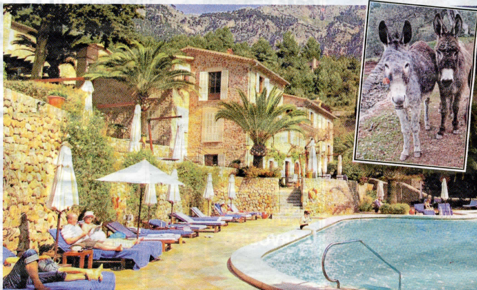
Star sanctuary: La Residencia and (inset) its charming donkeys

Mallorca Farmhouses (0845 800 8080, mallorca.co.uk ) has villas with pools from £950 to £7,270 a week.