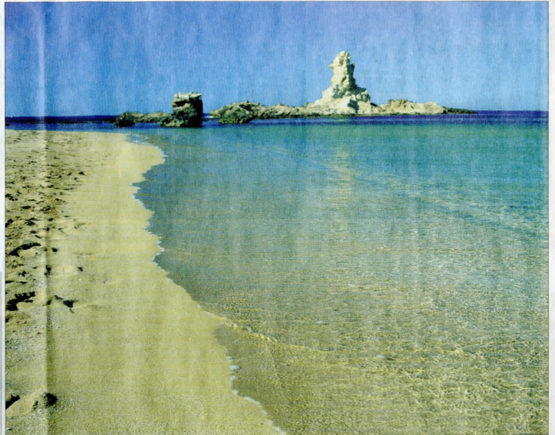
Pregonda beach, Menorca, above left; a bar in Muro, Majorca, above, right

towards Sóller. Just outside the village, look out for a turning to the left and drive carefully down the winding lane. You have to walk the last 200 metres. ☎ Tourist information (00 34 971 173990; www.illesbalears.es ; www.infomallorca.net )