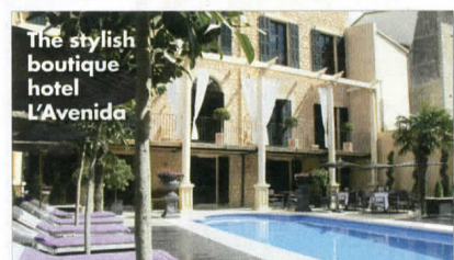
The stylish boutique hotel L'Avenida

Despite its old-fashioned façade the eight rooms are distinctly modern, with snazzy bathrooms complete with Philippe Starck fittings and Korres products, flat-screen TVs, glam black chandeliers and gorgeous grey silk drapes. OK! loved the beautiful mix of old and new, not to mention the gorgeous interior courtyard complete with a large pool encircled with decadent comfy sofas, funky cowhide seats next to oversized lamps that look more like art.