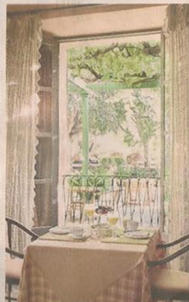
10 For simplicity Can Guilló, Pollença