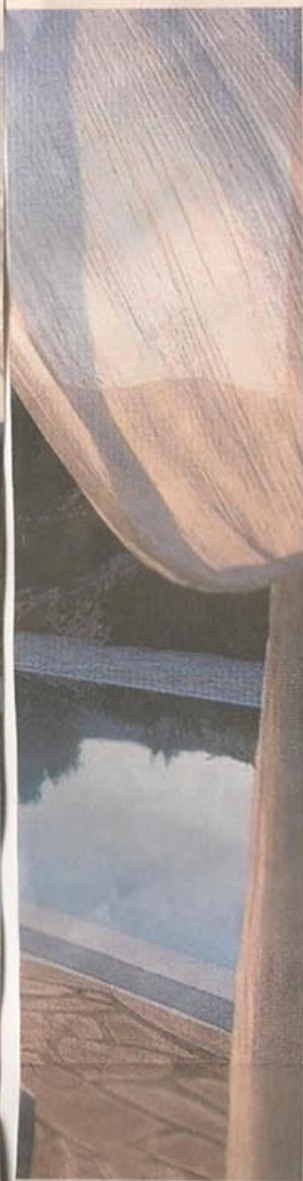
Clockwise from main picture: The stunning Cases de Son Barbassa