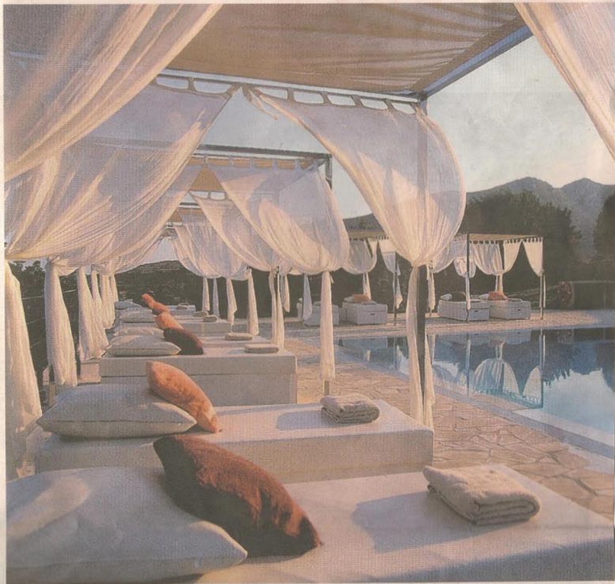
8 For old school charm