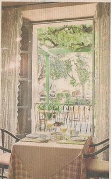
Clockwise from main picture: The stunning